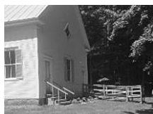
Reeds Mill Church

If you have received this through the U S Postal Service and have an email address, we would appreciate having it; please send it to vrobie@live.com . Church information is all you will receive via email.